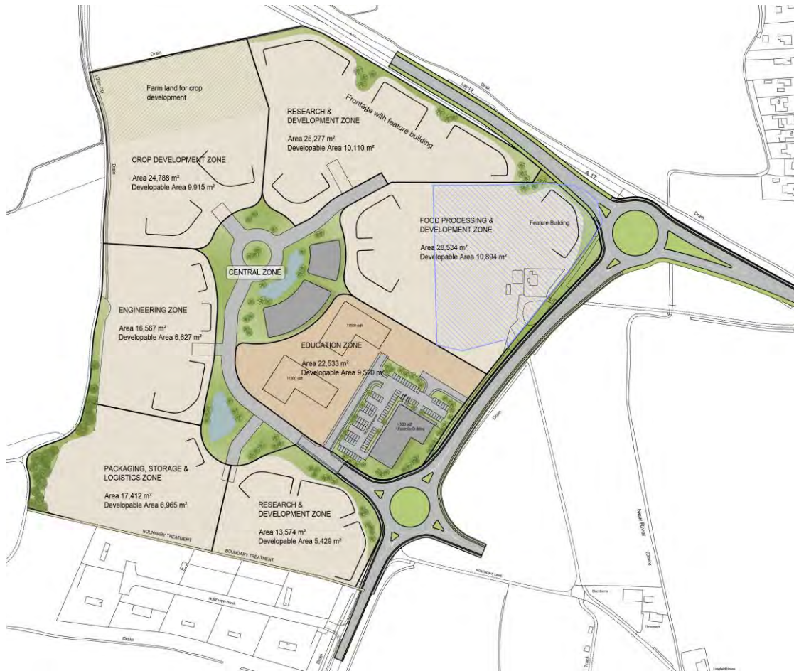
Figure 2 Composite plan showing SLFEZ site, proposed residential development, Peppermint Junction improvements and University of Lincoln scheme