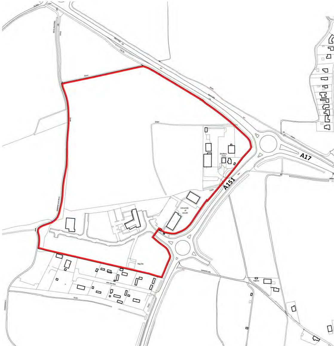
Figure 1 Location Plan

4.1. The site lies to the south west of the A151/A17 junction, known as Peppermint Junction to the west of Holbeach.