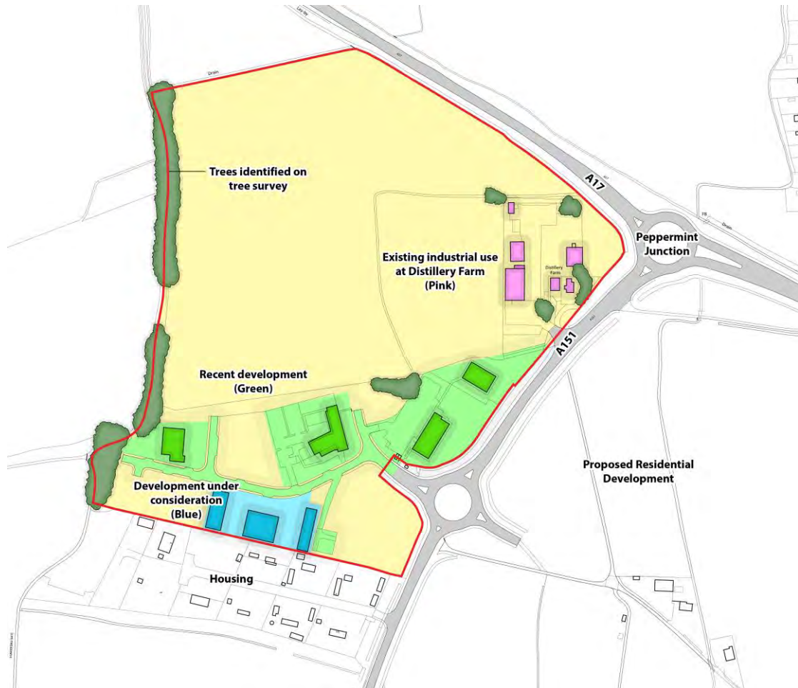
Figure 4 Constraints Plan

within the SLFEZ or to another appropriate site. The rest of the site is in agricultural use, characterised by fields, dykes, hedge lines and a small stand of trees set back from the A151 boundary.